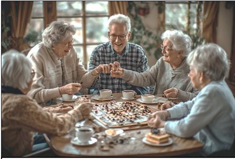
AI generated image

We had our first games group in January. It was a good turnout of ten people despite the flooding that day.